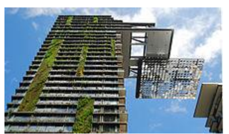
Hanging gardens of One Central Park, Sydney

According to Global status report from the year 2016, buildings consume more than 30% of all produced energy. The report states that "Under a below 2°C trajectory, effective action to improve building energy efficiency could limit building final energy demand to just above current levels, meaning that the average energy intensity of the global building stock would decrease by more than 80% by 2050".<sup>[13]</sup>